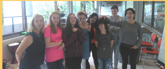
Happy days - the class of June 2017!

The Lothian Self-Management Project is already on its third programme of the year. This year we have introduced volunteering to complement the programme as well as extra social activities to help everyone keep in touch. The young people in the 12-18 programme concluded the workshops with music therapy with everyone singing, rapping and beat-boxing to Ed Sheeran and songs from Moana!